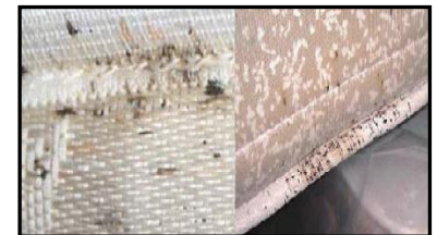
Blood stains and fecal spots on a mattress

Live bed bugs, eggs and cast skins indicate a bed bug infestation. Small black or rusty colored spots found on bed linens, pillows, or the mattress may be blood spots and bed bug droppings.