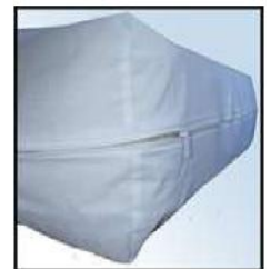
A zippered bed bug proof cover can help protect against