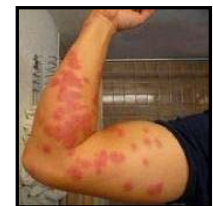
Welts from bed bug bites