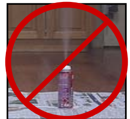
Do not use foggers