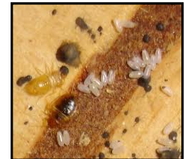
Bed bug eggs and cast skins