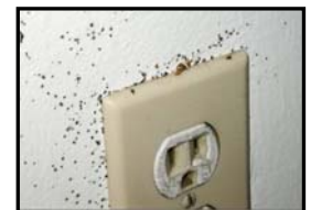
Fecal spots by outlet cover